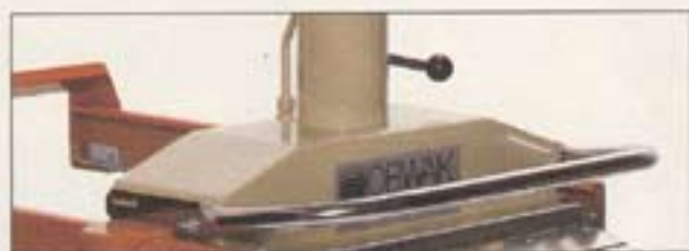
Telescopic cylinder for minimum height.

The process is repeated until bag is full, leaving a neat, easy to handle, hygienic package.