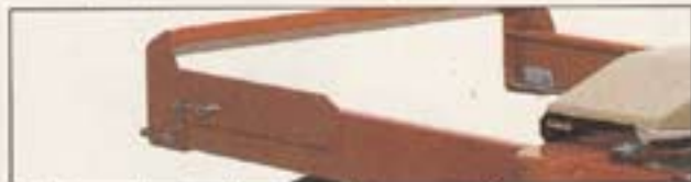
Locking mechanism for press unit in rear position.